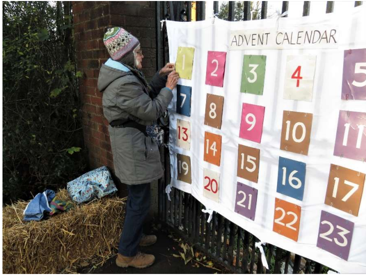
'Opening' the first door [1 December 2020]