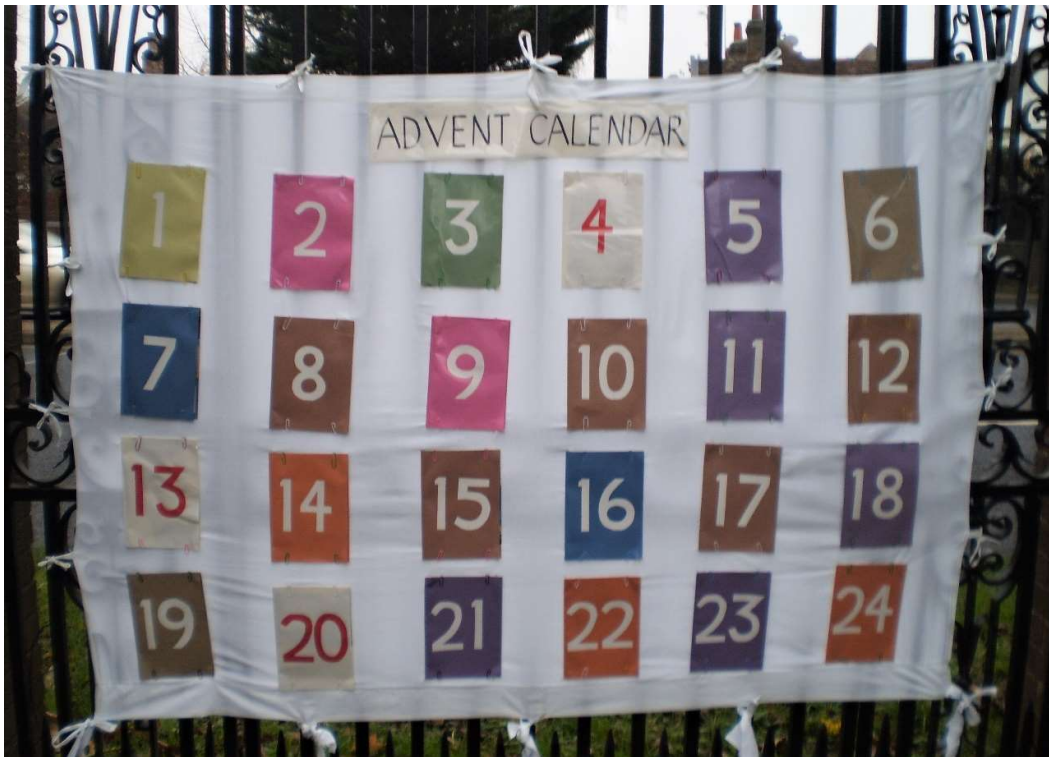
Advent Calendar fastened to the gate [30 November 2020]

Location. Cleared path, straw bales, decorations on adjacent trees [30 November 2020]