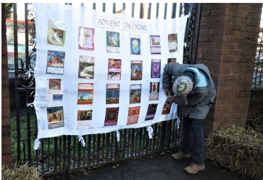
'Opening' the final door [24 December 2020]